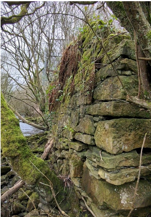
South side bridge abutment