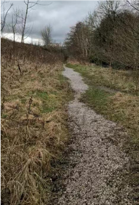
Typical trail section